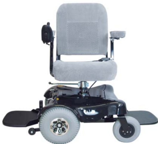
Convertible with Dual Footplates Height, Length & Angle adjustable

The PaceSaver Scout MI power base helps you enjoy an exciting, invigorating pace. Enabling you to spend more time doing things that you enjoy with family and friends. The American made MI Convertible™ is the most advanced power base of its kind.