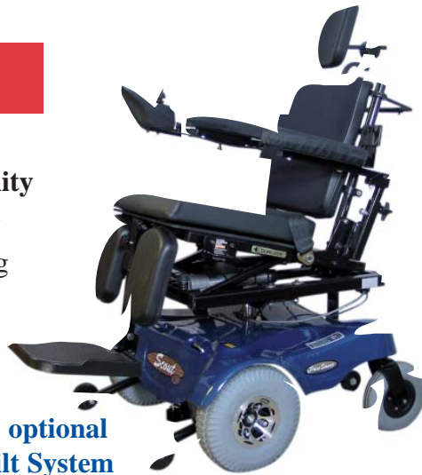
Shown with optional Equalizer Tilt System