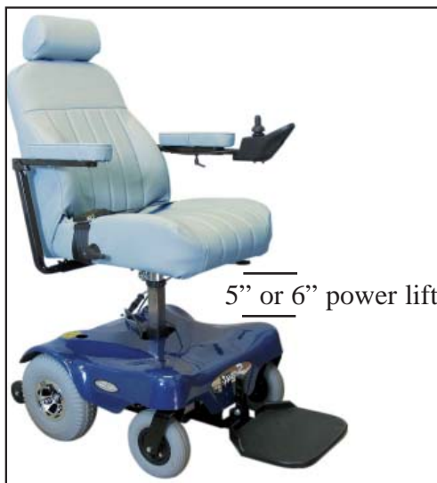
5" or 6" power lift