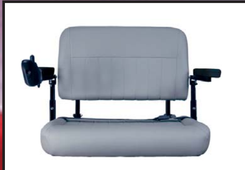
Com-For-Back™ Seat (CC)

Visit WWW.PACESAVER.COM For More Information