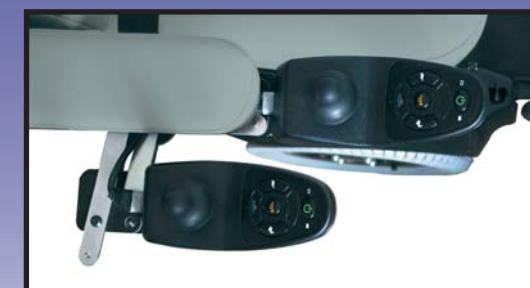
Optional Swing Away Controller