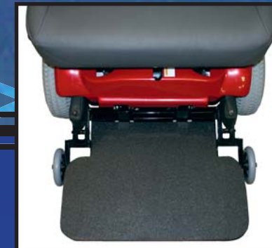
Extra-Wide FootPlate Custom Sizes Available