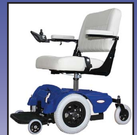
Optional Power Seat Shown on BOSS 4.5