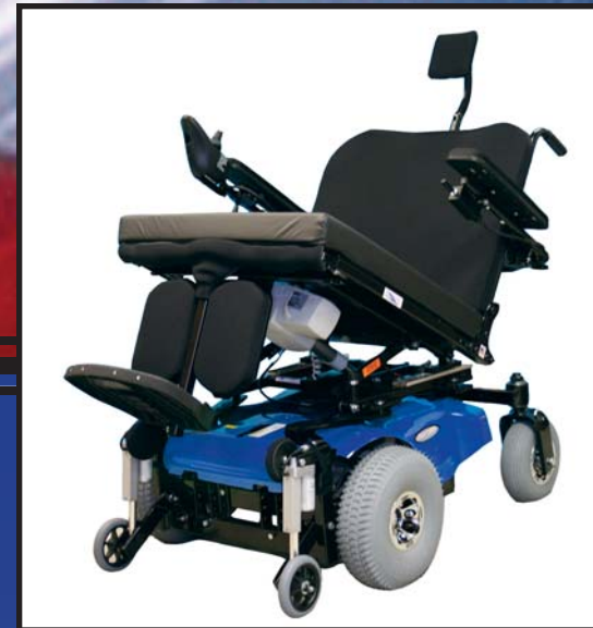
Heavy Duty Tilt