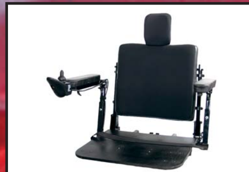
1 of 4 Solid Seat Styles (SS)