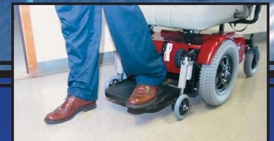
Optional Stanza™ Power Anti-Tips