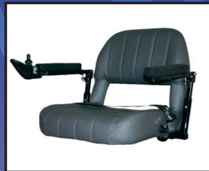
Admiral GPS™ Seat