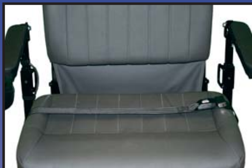
Optional Privacy Flap