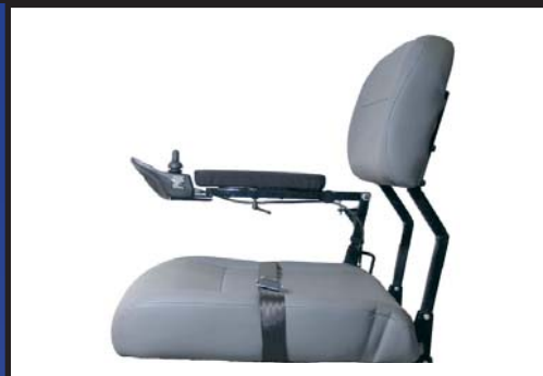
Gluteal Shelf™ Seat