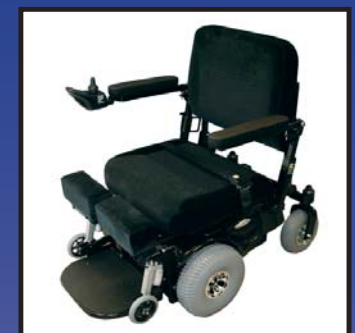
Amputee Stump Support