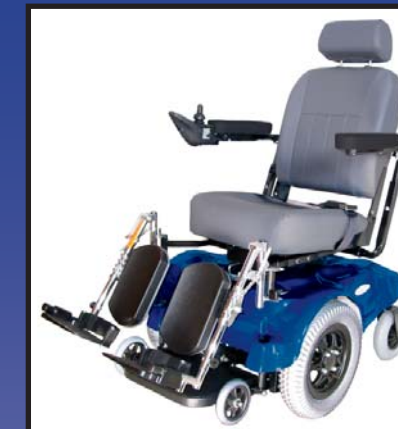
Optional Headrest and Heavy Duty 650 lb. Elevating Legrests